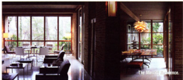
The Merritt Residence.