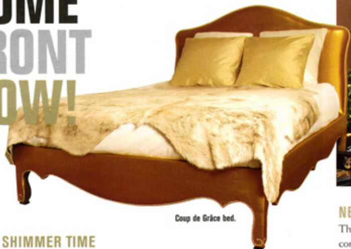
Coup de Grâce bed.