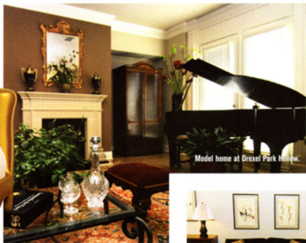
Model home at Drexel Park hollow.